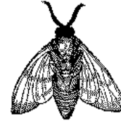
Figure 3: A sample black and white graphic that has been resized with the includegraphics command.

convert .eps to .pdf for you on the fly. More details on each of these are found in the Author’s Guide .