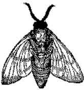
Figure 3. A sample black and white graphic that has been resized with the includegraphics command.

As was the case with tables, you may want a figure that spans two columns. To do this, and still to ensure proper “floating” placement of tables, use the environment figure* to enclose the figure and its caption. And don’t forget to end the environment with figure* , not figure !